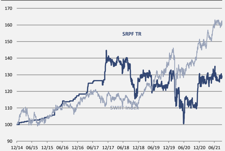
Suisse Romande Property Fund (SRPF) and SWIIT 1